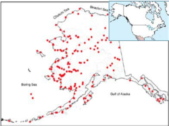
Locations of tribes in Alaska

By supporting his argument with an illustrative map, Gaffigan points out that geographically, regions such as Alaska and Oklahoma are areas with a higher concentration of Native American populations. Historically, Native Americans were displaced and pushed westward, as evidenced by the designation of Indian Territory in what is now Oklahoma, a relocation often associated with the Trail of Tears. Alaska, with approximately 20% of its population being Indigenous, presents a unique case due to its vast Arctic terrain.