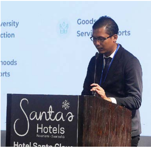
Normas Andi Ahmad

To address these issues, the audit proposed recommendations to refine regulations on forest area clearance, enhance stakeholder coordination, conduct community outreach and education, and allocate sufficient resources for business development initiatives. By implementing these recommendations, Indonesia aims to strengthen the integration of Indigenous knowledge in forest management, promote sustainable practices, and empower local communities to thrive while conserving their natural resources.