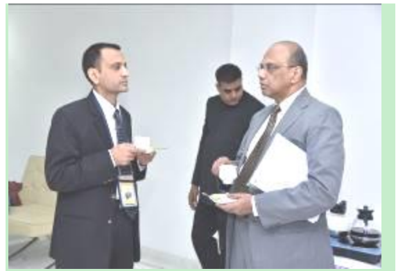
Brain storming over Tea