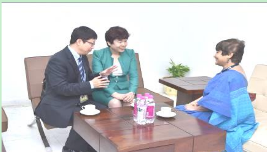
Common concerns erode language barriers