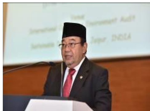
Chair of INTOSAI WGEA addressing the seminar