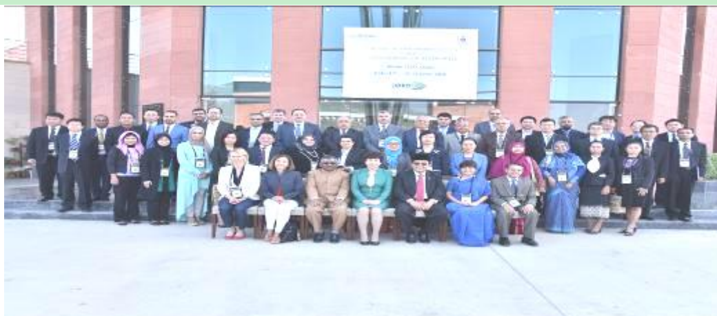
Delegates in Attendance