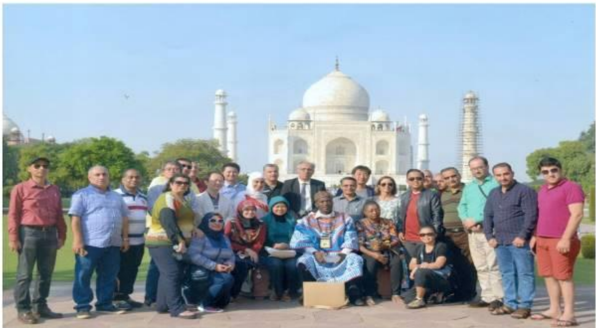
Delight moments: Participants at the TAJ MAHAL

After the two days brain capturing session and presentations, International Centre for Environment Audit and Sustainable Development (iCED), organized a tour of the “TAJ MAHAL” (identified as wonder of the world) for the participants on October, 19 th to rejuvenate the participants.