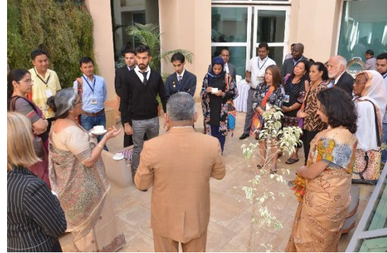
Discussions over a cup of tea

Feedback received from participants showed that they learnt a lot from the sessions. Sessions had improved their understanding of the subject, met their expectations and the sessions were capable of stimulating their interest. The feedback also indicated that participants felt that trainers' knowledge of the subject matter was excellent, trainers had organised their material effectively, were very well prepared and were responsive to needs of participants. Overall feedback for the 3 rd program indicated that length of the training program was just right, no modules needed to be deleted and that their SAIs would be interested in future such courses and specialised courses too.