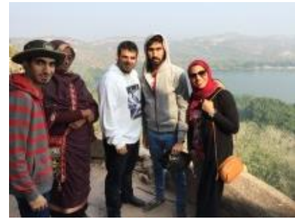
Participants on the Biodiversity trip

As part of our biodiversity module, we planned a biodiversity trip to Tiger Reserve, Ranthambhore and a session on protection of tigers in the Tiger Reserve. The participants found the trip very relevant to appreciating the concept of biodiversity and its preservation. Participants were thrilled to watch