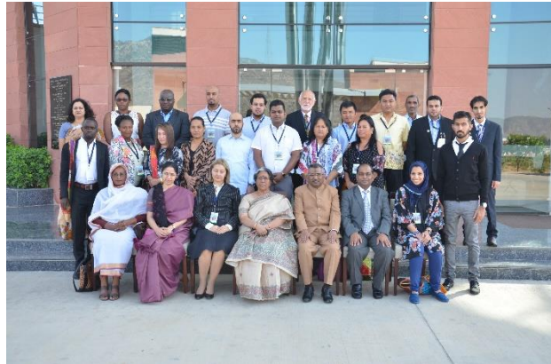
Participants with Dy. C&AG

3 rd International Training Programme on “Introduction to Environmental Auditing” held from 16 th to 30 th November, 2015 at iCED was attended by 22 participants from 11 countries across the world viz. Bhutan, Federated States of Micronesia (1 participant each from Chuuk State, Kosrae State and Pohnpei State), India, Nauru, Oman, Saudi Arabia, Sudan, Tanzania, Senegal, Thailand