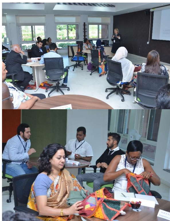
Participants in the training sessions

Unique feature of the programme is that various modules have been developed by SAIs of different countries and the course developers from the different SAIs deliver these modules at iCED. For the Biodiversity module we had a trainer from Brazil, for the sustainable development module, we had a trainer from Estonia, for the waste module we had a trainer from India, for the water module we had trainers from Indonesia and for the module on climate change we had trainers from PASAI and Federated States of Micronesia. We believe that this unique model offers participants different perspectives of how environment systems are managed and audited across the world.