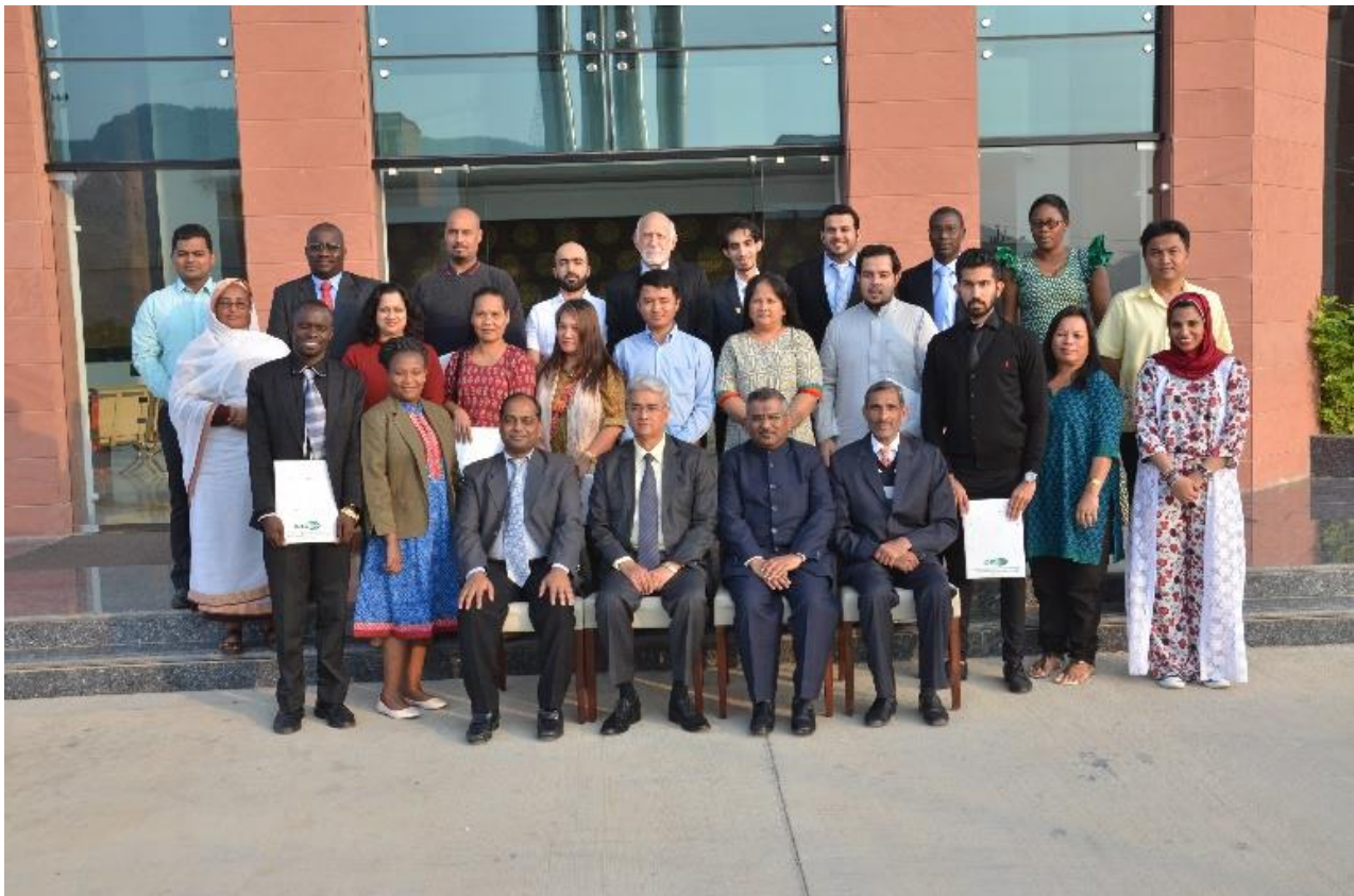
Participants with the Comptroller & Auditor General of India