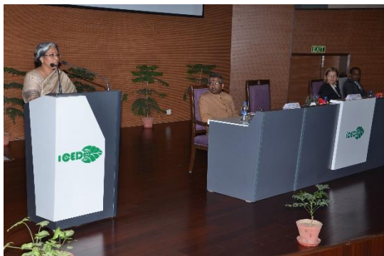
Inauguration by Dy. C&AG