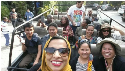
Participants on Tiger Safari in Ranthambore National Park