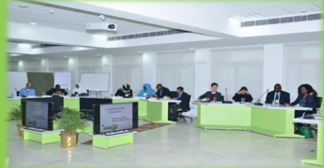
Training Hall - "Aravali"

Meeting Rooms, Auditorium for 175 persons, Rooms for Research Associates and Wi-Fi enabled campus.