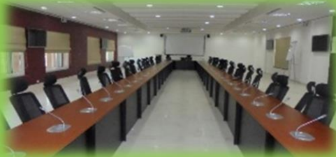
Training Hall - "Saraswati"