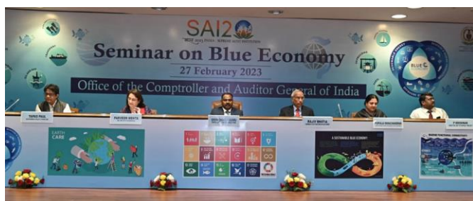
Mr. Girish Chandra Murmu, CAG of India, attending the SAI20 seminar on Blue Economy

The Comptroller and Auditor General (CAG) of India Girish Chandra Murmu, as chair of the SAI20 Engagement Group, chose Blue Economy as a priority area for the group under India's G20 presidency. To begin discussions about this priority area, SAI India hosted a seminar to discuss the challenges and opportunities, share knowledge, and gather perspectives from experts in the field of Blue Economy during the SAI20 Summit, held in Goa, India.